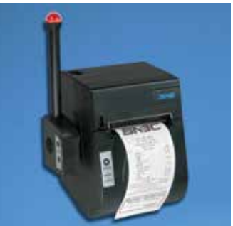
Built-In Wall Mount Capability and Optional Audio/Visual Print Messenger