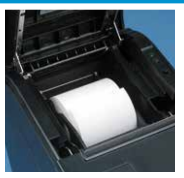
Drop and Print Paper Loading with an Adjustable Paper Width Selector