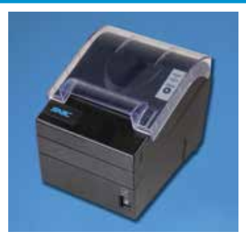
Optional Spill Cover