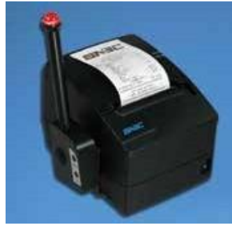
Optional Audio/Visual Print Messenger