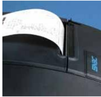
Liquid Guard Built Into the Cabinet Design