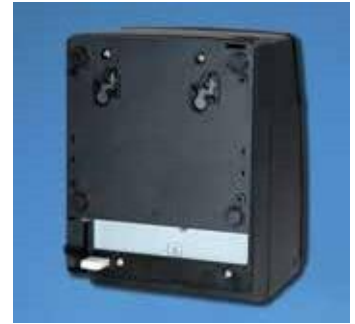
Built-In Wall Mount Capability