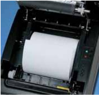
Drop and Print Paper Loading