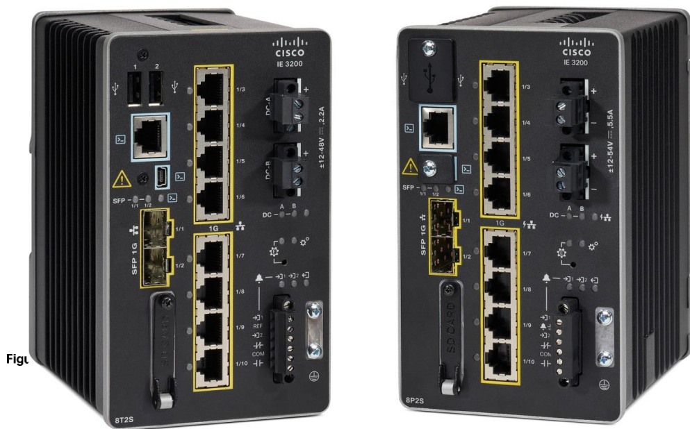
Cisco Catalyst IE3200 Rugged Series

The IE3200 series supports power budget of up to 240W for PoE/PoE+, shared across 8 ports, and is ideal for connecting PoE-powered end devices such as IP cameras, phones, wireless access points, sensors, and more.